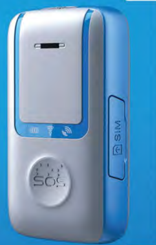
2.75" / 7 cm high and weighs 4 oz.